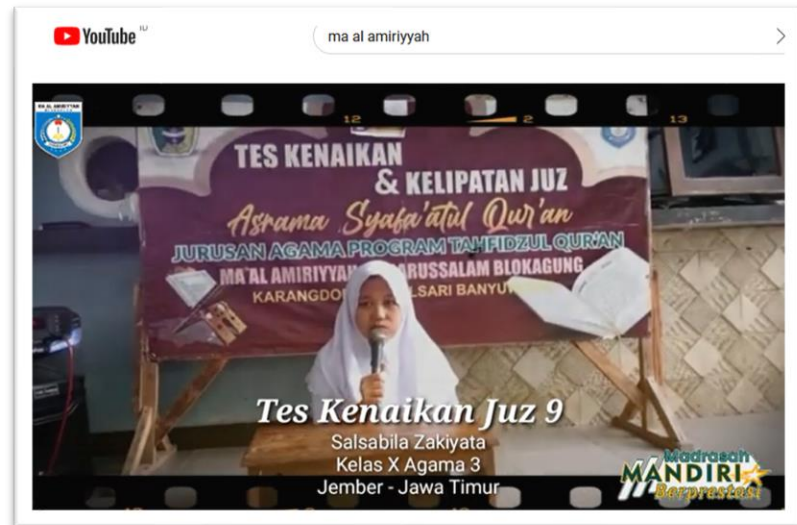
Figure 3: Test Increases and Multiples Juz