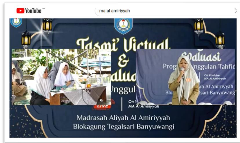
Figure 2: Activity tasmic

Activity tasmik quarterly and 6 months held offline and online, with Meaning as report activity results evaluation to guardian student during follow tahfidzul Qur'an program activities at Madrasah Aliyah Al Amiriyyah that can be done seen on the YouTube channel .